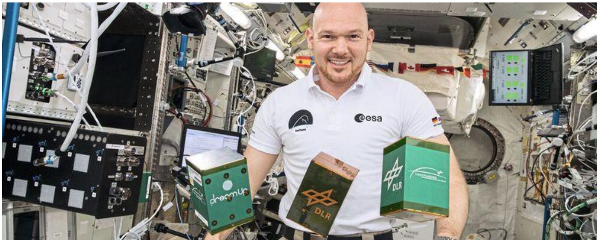
The German ESA astronaut Alexander Gerst with the experimental boxes.

Space travel offers opportunities for research to expand our knowledge in a cosmic environment that's not too far away. How liquids behave in space represents a major challenge with this research