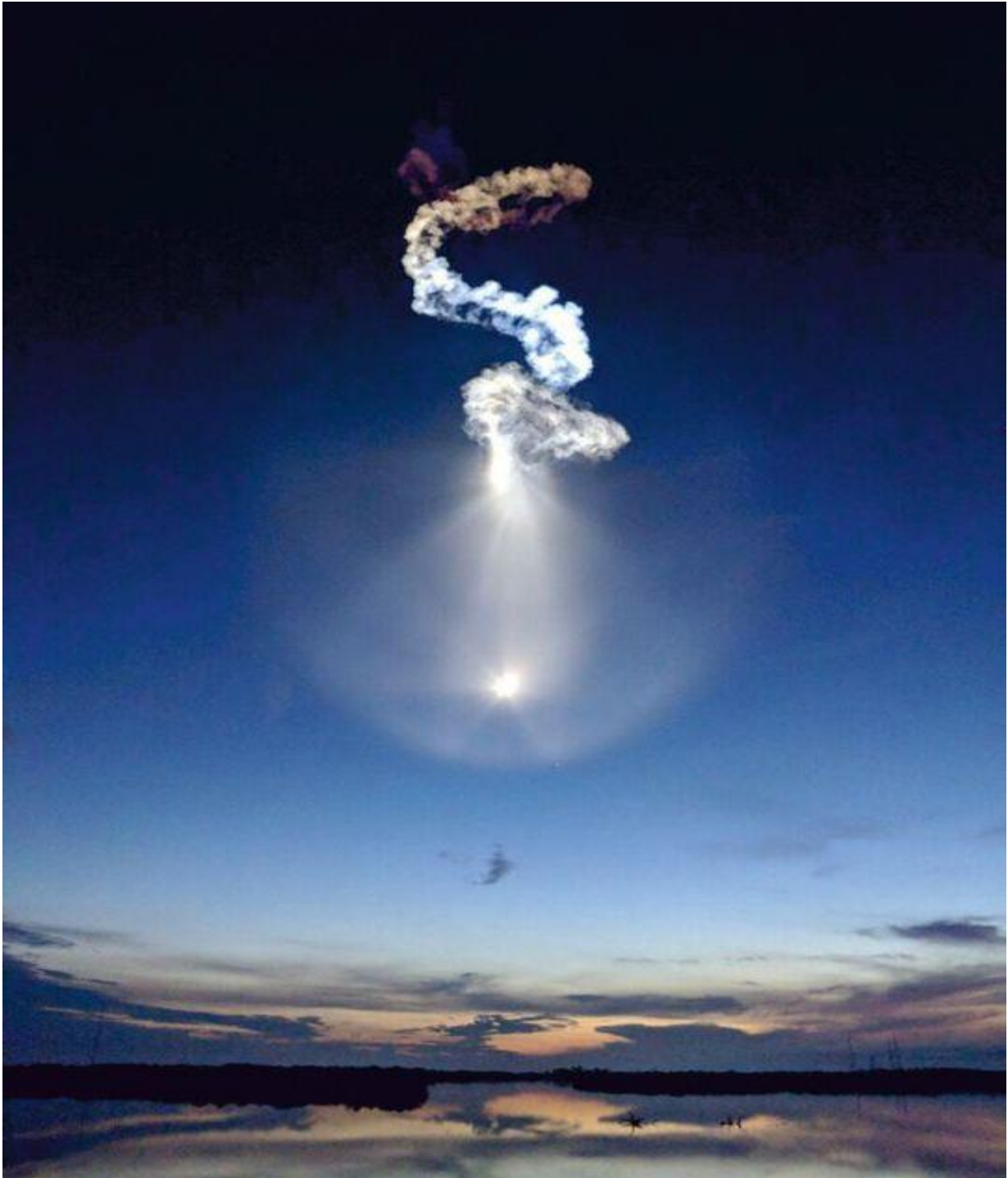
A reusable self-landing Falcon-9 rocket launched by the company Space-X delivered the experiments to the ISS.