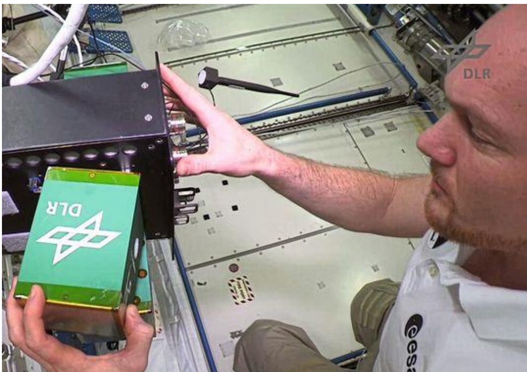
Astronaut Alexander Gerst integrating the PABELL Box

A lot of the components included in the box were constructed using modern 3D-printing procedures, such as metal-laser sintering. The scientists designed the internal battery system to be an ideal solution to the requirements. The electronics included circuit boards they had designed themselves as well as off-the-shelf Raspberry Pi computers, lithium-polymer batteries, grids with commercial electromagnets and LEDs for illumination. In addition, SMD components were also used to measure the temperature, the magnetic field, vibration and noise(s) and Raspberry Pi cameras were added to make visual recordings of the system's sensor readouts.